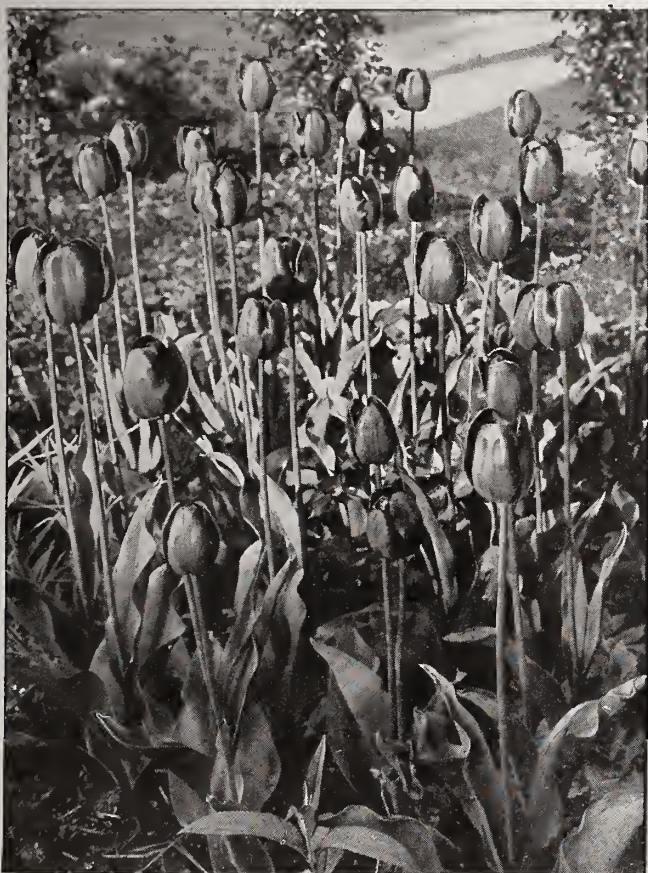
The artistic colors of the Dutch Breeder Tulips lend a distinctive and refined atmosphere to the flower border

Breeder Tulips are very similar in habit to the Darwins, and flower at the same time. Their chief characteristic is their immense blooms, borne on strong, stiff stems, many of them longer than the most gigantic Darwins. The revival of the taste for art colors has made these Tulips, at one time very popular in England, strong favorites with American enthusiasts, who find in their bronze, buff, and brown shades excellent material for contrasting with the light and bright colors of the Darwins. They require the same cultural treatment as the Darwins.